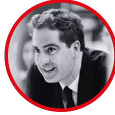
Olivier Becht Member of Parliament for Haut-Rhin - Alsace Former Minister Delegate for Foreign Trade