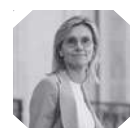
Agnès Pannier-Runacher Minister of Ecological Transition