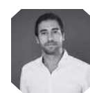
Mathieu Flamini International footballer