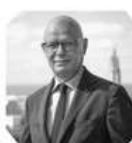
Edouard PHILIPPE Former Prime Minister Mayor of Le Havre